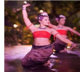
Learning Thai Dancing