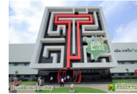
Ayothaya Floating Market