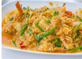
Pad Pong Kra Ree

12:00-13:30pm Eating Lunch with your own cooking food