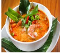
Tom Yum &